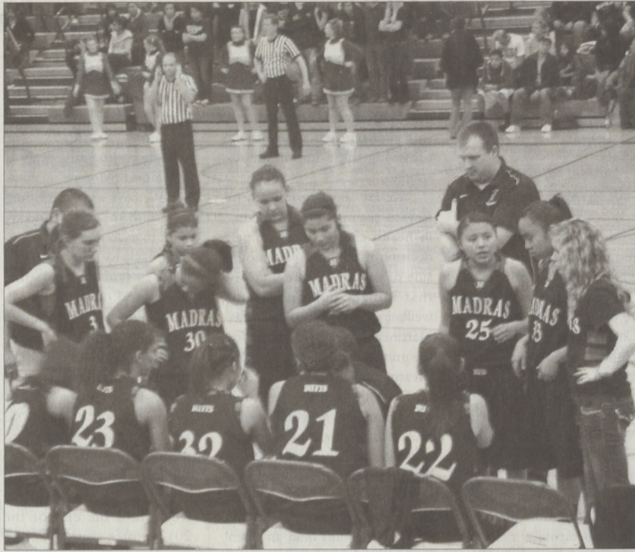
The Madras girls extended their win streak against Sisters at home, Feb. 24.

The girls play at 1:30 p.m. this Wednesday at the Gill Coliseum at Oregon State University. They are a top seed, with Sutherlin, in the tournament. The semi-finals are on Friday at 1:30. The third-fifth place game is on Saturday; and the championship is at 6:30 p.m. Saturday, March 10. (See schedule below.)