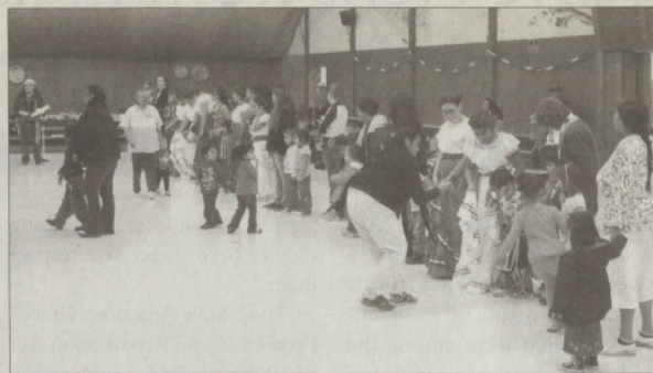
The Madras High School Culture Enrichment Club performed at the Agency Longhouse last Thursday for the children in Head Start.

The performances included traditional Hispanic dances, traditional Native American dance and Native American flute music.