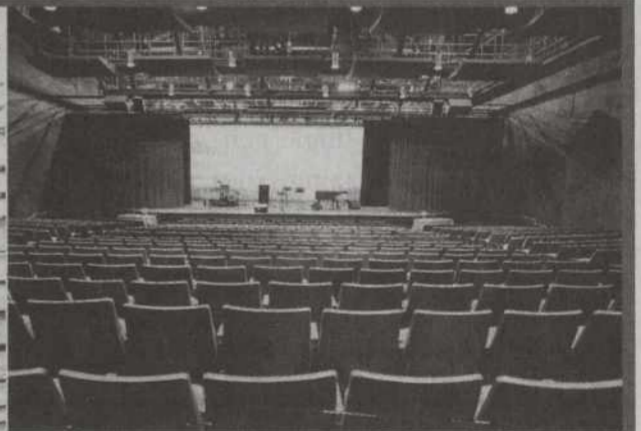
Southwell Auditorium in Prineville is a model for a similar auditorium in Jefferson County.

Springs Reservation. The district would seek the other half of the project through a voter approved bond.