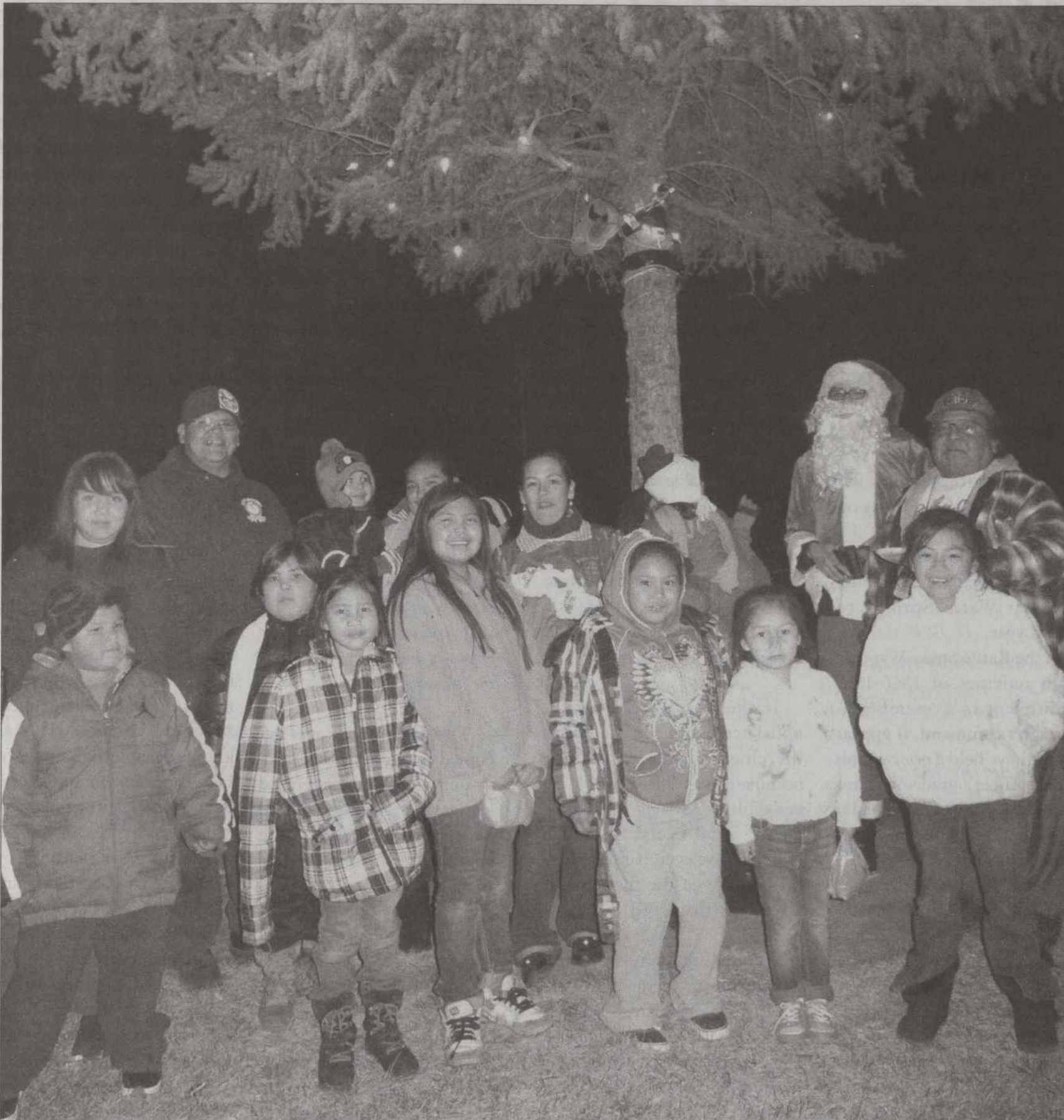
After the Lights Parade last week, families gathered at the community center for the Tree Lighting.