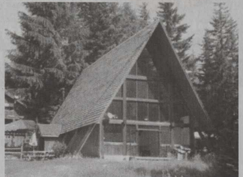
Interpretive Center at Mt. Hood Ski Bowl will display information of the Confederated Tribes

The next meeting of our two groups is scheduled to be at the Interpretive Center to visualize some of the layouts of information that will be displayed.