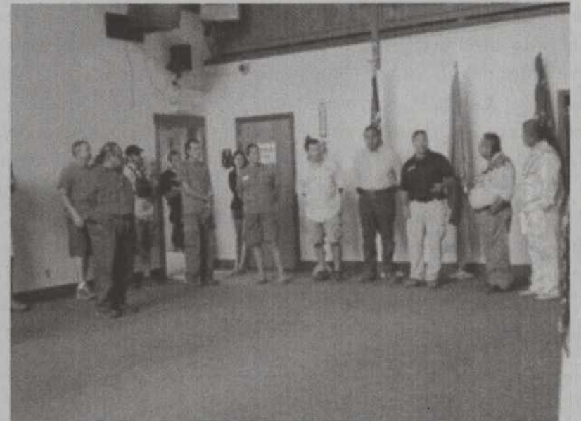
Mt Hood Ski Bowl Staff and the Culture & Heritage Language Program staff met again to begin the process of getting the "Interpretive Center" ready with informaion of the Confederated Tribes.

Togano tsa'apu mabew moo'o Spirits come out at night