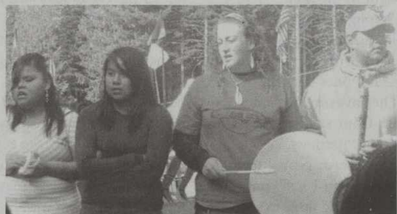
Warm Springs youth participate in National Native American Day activities.