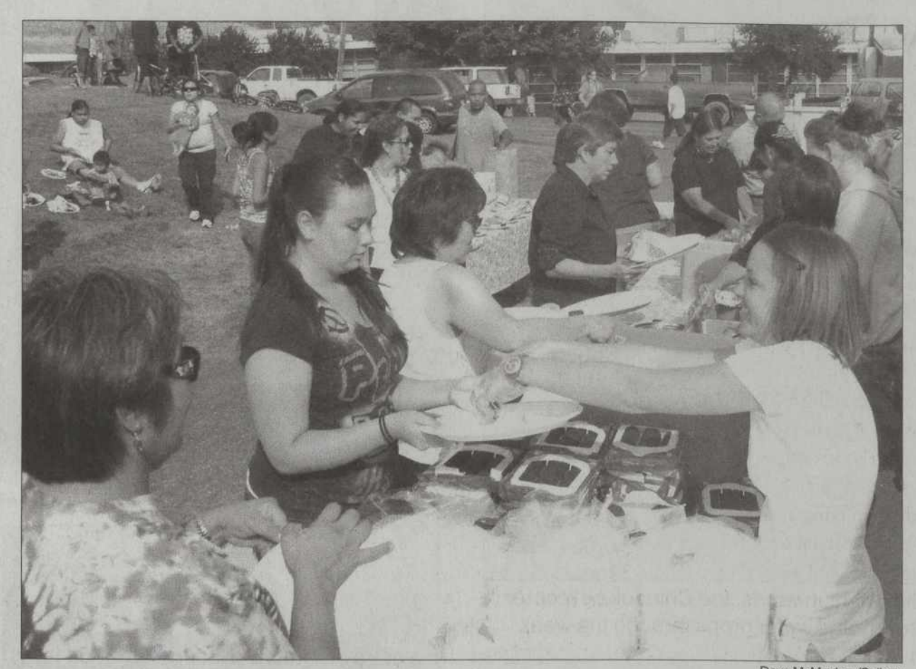
Volunteers serve at the Back to School Barbecue at the elementary school.