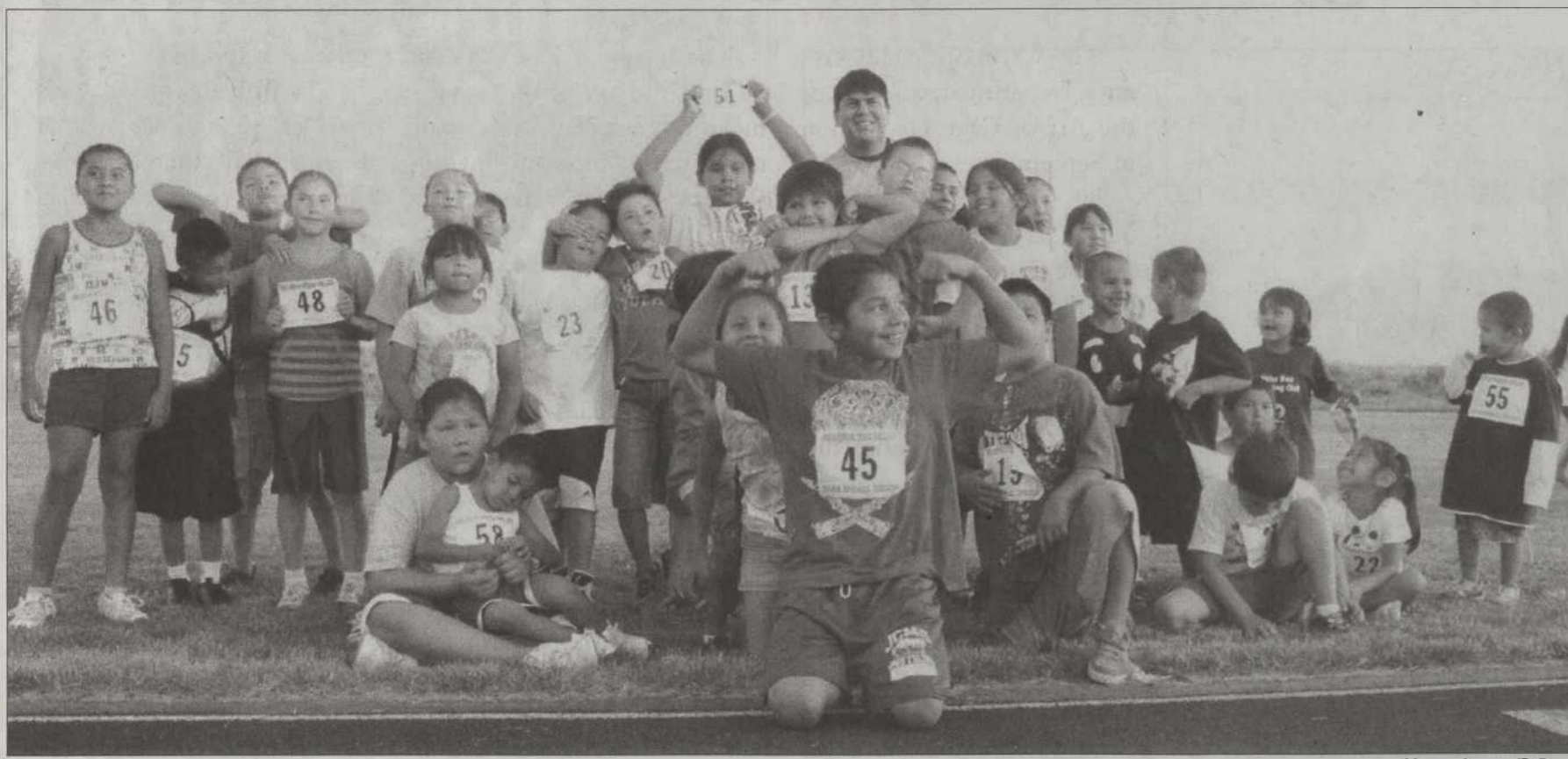
Youth gathered for a picture after the Annual Recreational Invitational Youth Track Meet held on August 10 at the Jefferson County Middle School. Events included: 50m race, softball throw, 100m race, 100m relay, long jump, and standing broad jump. Kids enjoyed the event and the adults enjoyed cheering them on.