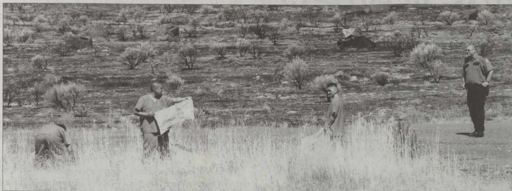
Inmate volunteers assist in clean-up along Hwy 3 in a service program which began last March.