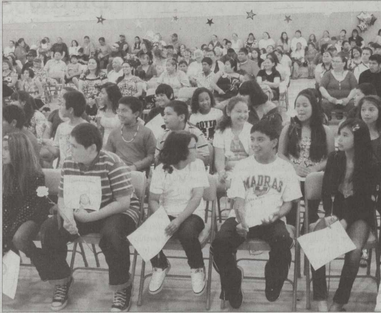
Fifth-grade students receive their diplomas at Warm Springs Elementary School.