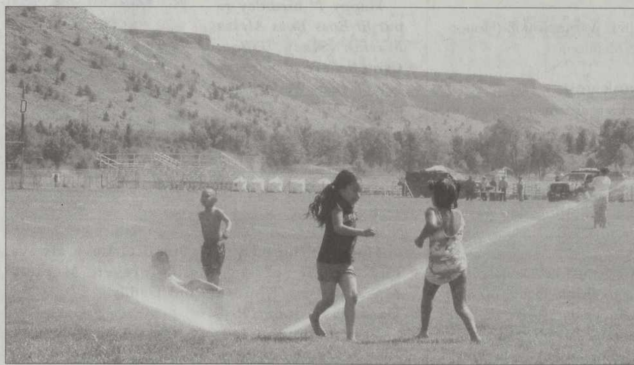
The Early Childhood Education Center held their graduation ceremonies last week. Part of the day's events included some water fun at the Community Center fields.