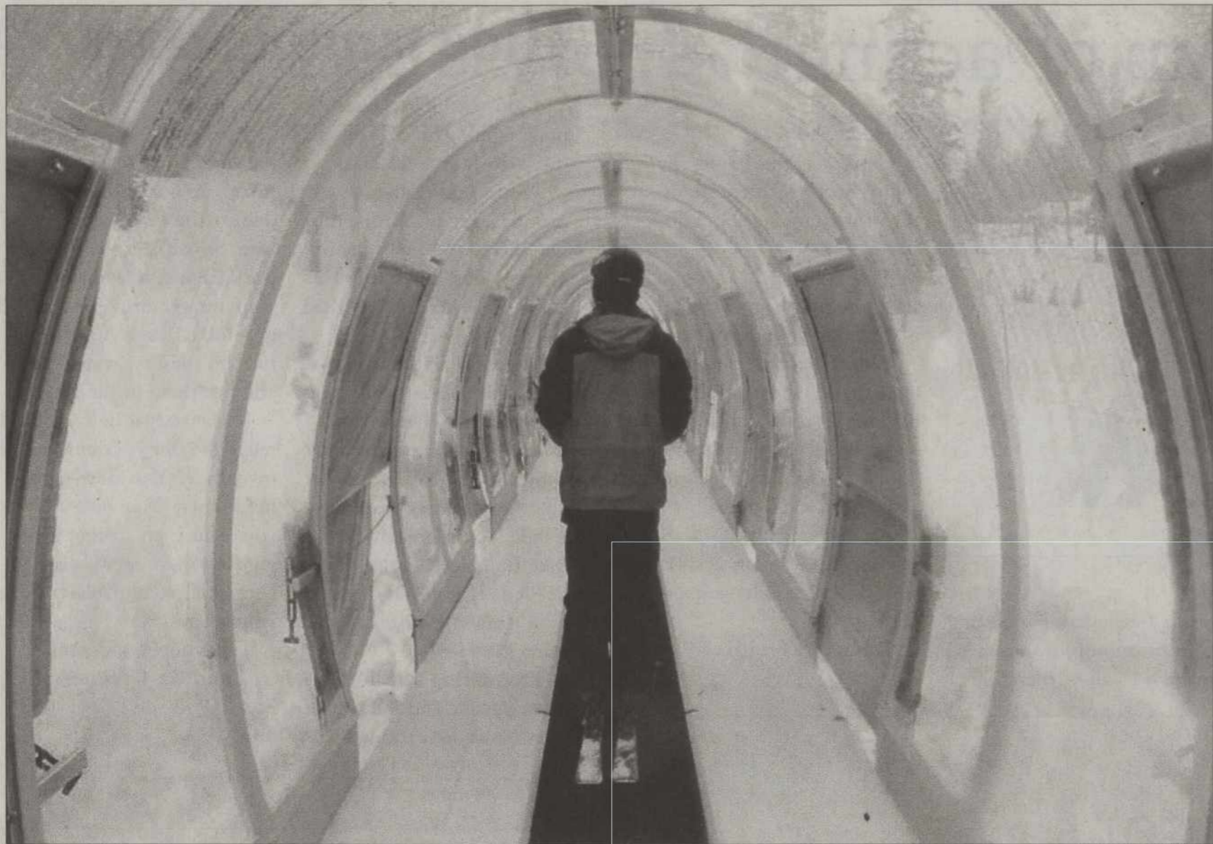
Warm Springs youth were able to enjoy one more ski day before the season ends at Mt. Hood Meadows. About 40 skiers and snowboarders and took to the slopes. Pictured above is the ski instructor assisting students on the magic carpet that brings you to the top of the beginner hill.