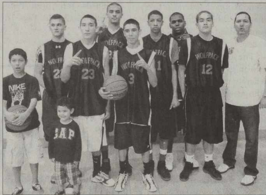
Tourney champions: Wolfpack (above) and Smash Town (below).