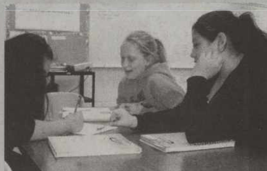
Students work on a group assignment in their reading workshop.