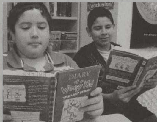
A double dose of reading success at Jefferson County Middle School.