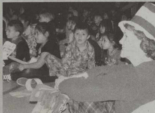
Celebrating Dr. Seuss at Metolious Elementary.