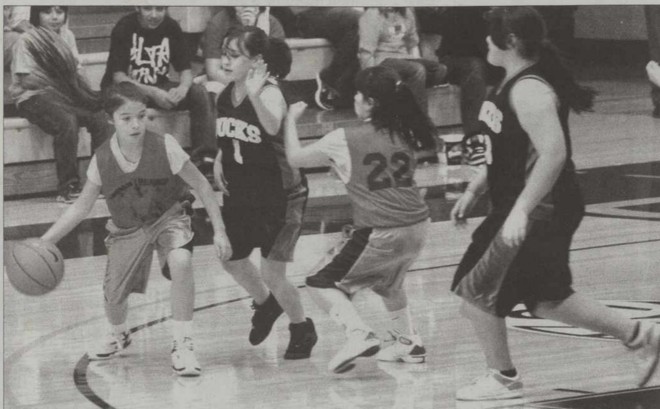
Sacred Thunder of Warm Springs faced Sprague during the OSU-Stanford halftime game.

"The Oregon State/Stanford women's game provided a great experience because the girls got to see women play at a higher level of competition," he said. "Some of the girls been prac-