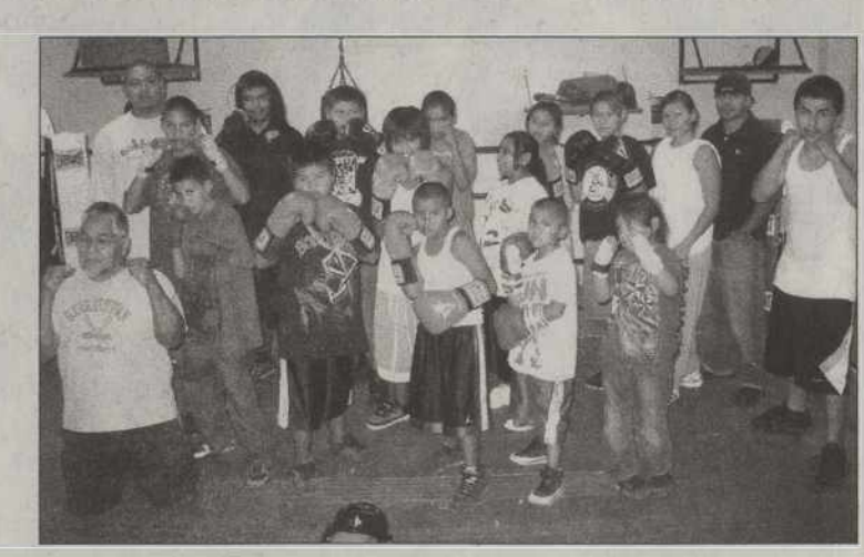
Sponsored by the Warm Springs Boxing Club.

29. Rezalution will be dents. Seniors, $3. the kick-off event for Kids under 7 free.