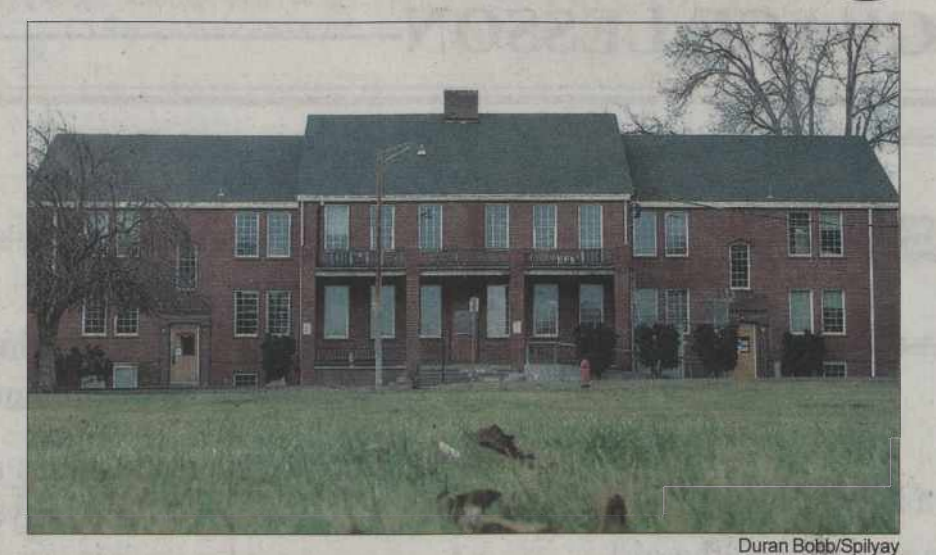
The Community Counseling Center will be improved through a grant of $1.3 million.

There will be a new reception area where the conference room is now located. Plans in-