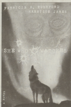
Book cover of She Who Watches