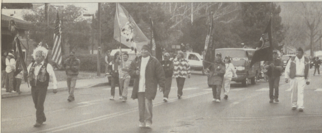
Parade from the Veterans Stone to Longhouse.

Residents of Warm Springs commemorated Veterans Day on Nov. 11 with a variety of Native American warrior and United States military traditions. Dozens of local Native Americans have lost their lives protecting the United States and the liberty enjoyed by all who live within its borders. Pictures of many of these men and women hung on a Longhouse wall as at least 200 residents paid tribute after a ceremony in front of the courthouse.