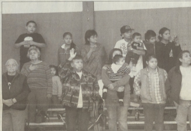
Tribal members remember.