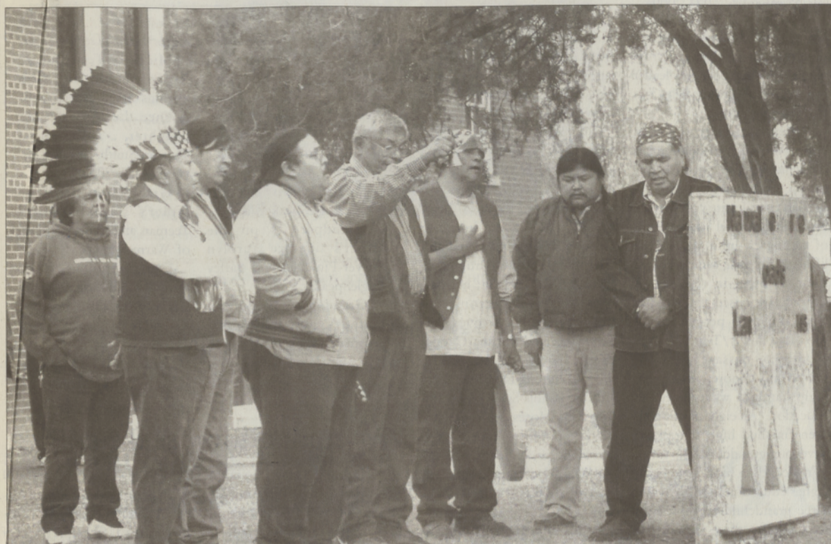
Service at the Veterans Stone.