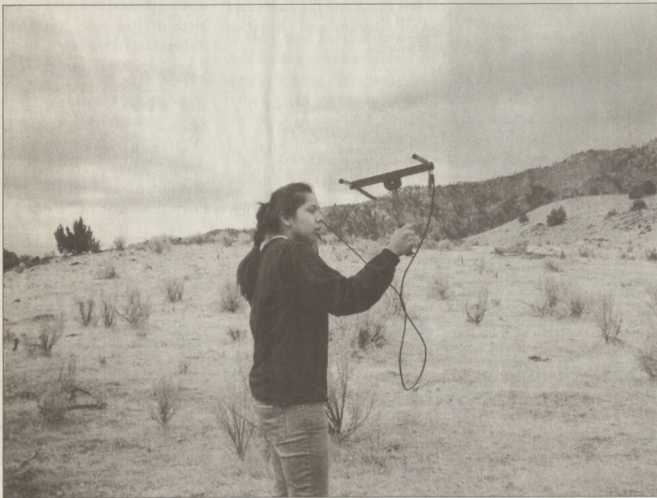
Tracking the location of big horn sheep in the Mutton Mountains.

The Summer Youth workers of the Natural Resources Branch took on a variety of projects over the past few months.