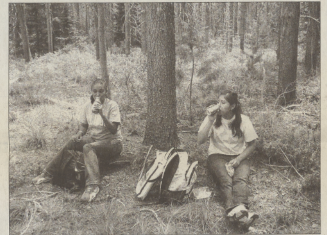
Break time during huckleberry picking.