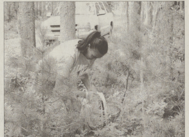
The youth workers went on a field trip picking huckleberries. The students then gave the berries to elders at High Lookee Lodge.