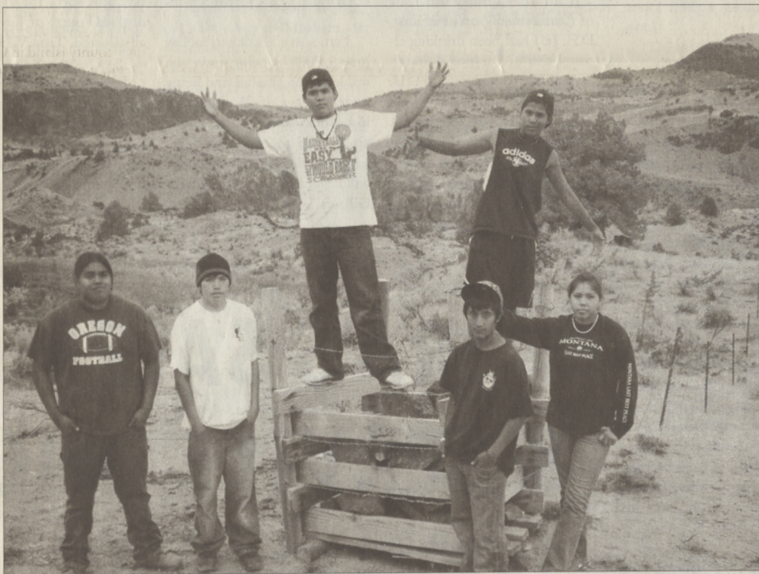
One project was to rebuild a rock fencing post. Below is the demolished post; and above, the rebuilt post.