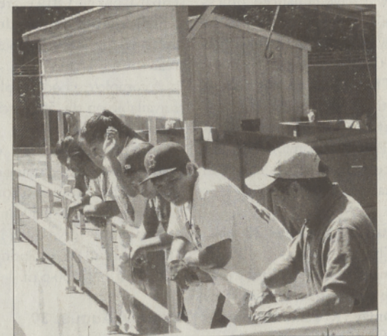
Fish hatchery field trip.