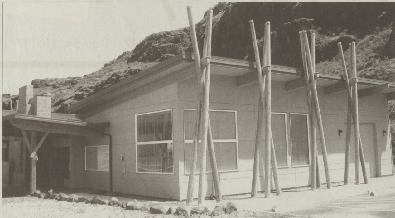
The new Celilo School and Administration Building.

Since the first steps toward its redevelopment, Celilo Village and the federal agencies worked together on a government-to-government level to develop a safe community with clean water, decent housing and an infrastructure to support residents and all who visit this place we