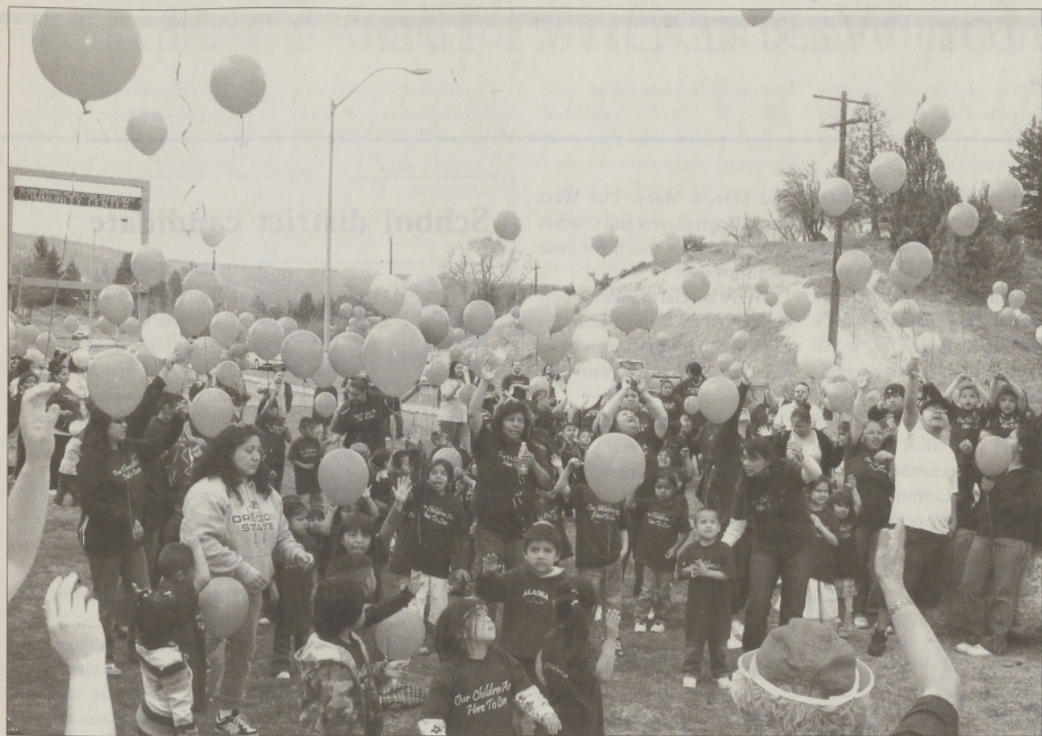
Children's Protective Services hosted Child Abuse and Neglect Prevention activities in April. One of the activities was the walk from Early Childhood Education and the administration building to the community center. At the community center, the walk participants released hundreds of balloons.