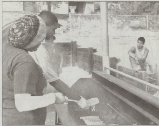
Volunteers cooked for the work crews.

Our most honorable mentions go out to Roberta Armstrong,