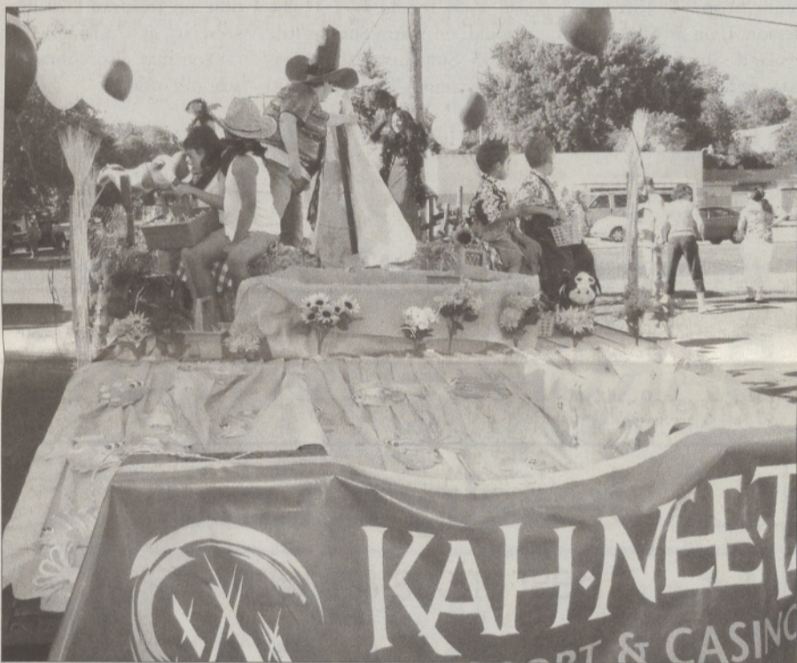
Kah-Nee-Ta High Desert Resort entered a float in the 2008 Jefferson County Fair and Rodeo Parade. The Kah-Nee-Ta entry won the Best In Show prize in the parade.

resses that do not meet these standards. For more information contact the Land Services Office at 553-3270.