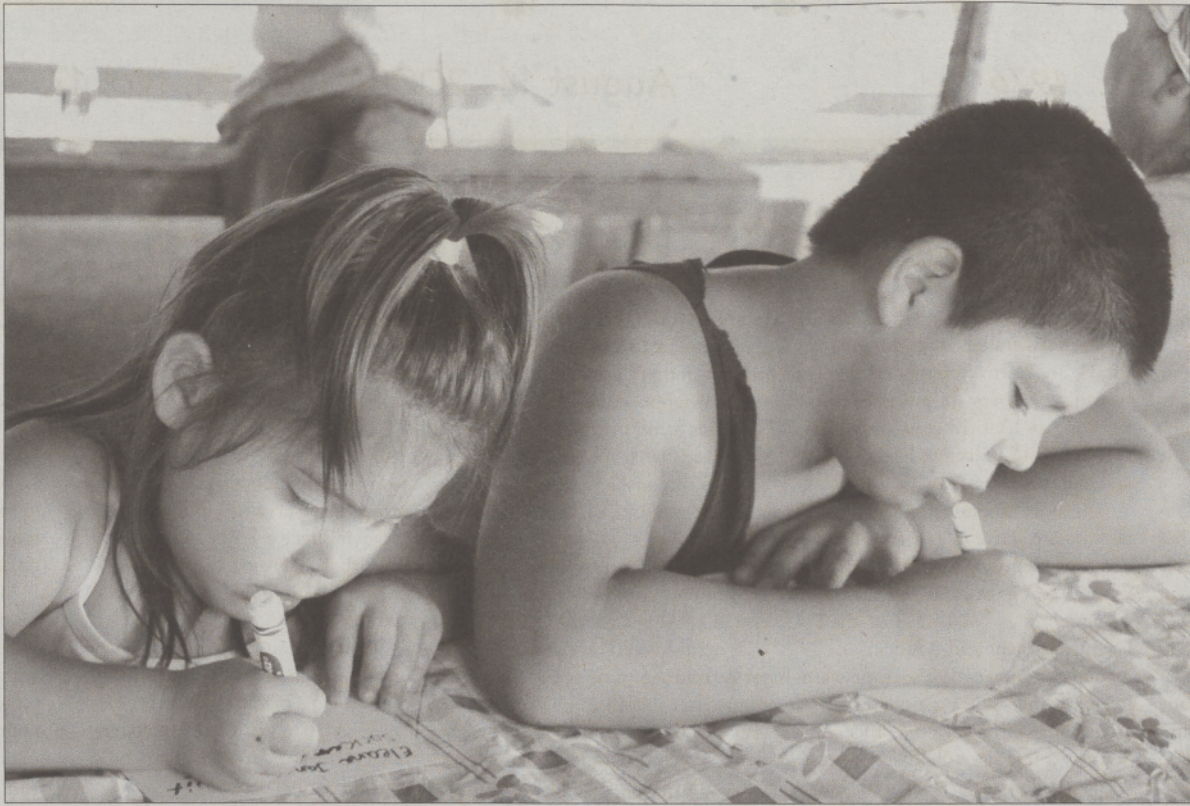
At the beginning of camp, families worked together to create a family shield to post outside of their teepee or tent. This year the focus of the culture camp was strengthening the bond between family members.

The families gathered materials and used art supplies for their family shields, which represented who they are and aspects of their family.