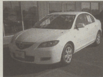
2008 Mazda3 Sport Sedan 4D Automatic, 4-Cyl. 2.0 Liter $17,995, NOW $16,840 Stock #P8035