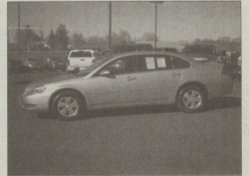
2007 Chevrolet Impala LT Sedan 4D Automatic, V6 3.5 Liter $16,895, NOW $14,840 Stock #P8044