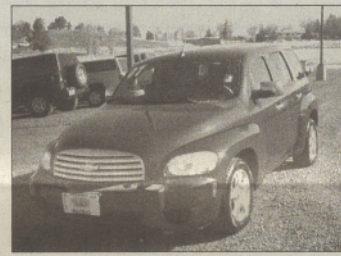
2007 Chevrolet HHR LT sport wagon Automatic, 4-cyl. 2.2 Liter $14,845, NOW $13,840 Stock #P8047