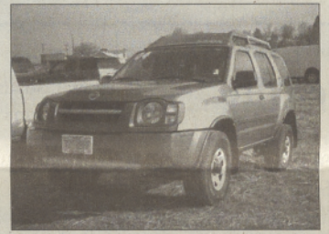
2004 Nissan Xterra XE Sport Utility 5-speed, V6 3.3 Liter NOW $13,840 Stock #P8053