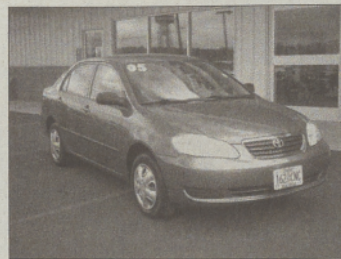
2005 Toyota Corolla CE Sedan 4D Automatic, 4-cyl. 1.8 Liter $13,665, NOW $11,840 Stock #0689A