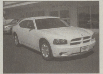
2007 Dodge Charger SE Sedan 4D Automatic, V6 2.7 Liter $21,780, NOW $17,840 Stock #P7080