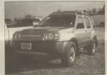
2004 Nissan Xterra XE Sport Utility 5-speed, V6 3.3 Liter NOW $13,840 Stock #P8053