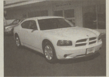
2007 Dodge Charger SE Sedan 4D Automatic, V6 2.7 Liter $21,780, NOW $17,840 Stock #P7080