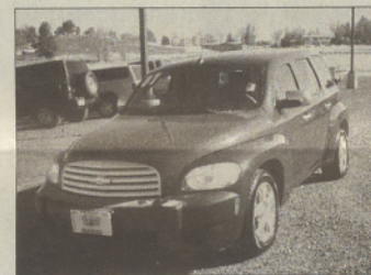
2007 Chevrolet HHR LT sport wagon Automatic, 4-cyl. 2.2 Liter $14,845, NOW $13,840 Stock #P8047