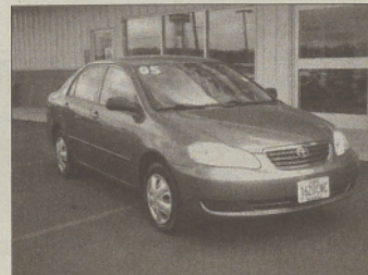
2005 Toyota Corolla CE Sedan 4D Automatic, 4-cyl. 1.8 Liter $19,565, NOW $11,840 Stock #0689A