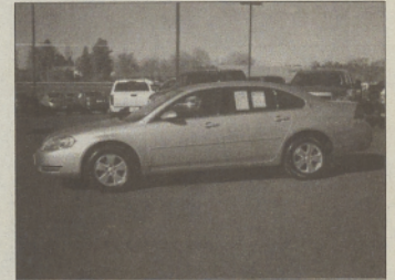
2007 Chevrolet Impala LT Sedan 4D Automatic, V6 3.5 Liter $16,895, NOW $14,840 Stock #P8044