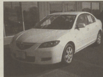
2008 Mazda3 Sport Sedan 4D Automatic, 4-Cyl. 2.0 Liter $17,995, NOW $16,840 Stock #P8035