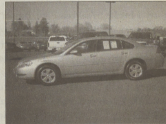
2007 Chevrolet Impala LT Sedan 4D Automatic, V6 3.5 Liter $16,895, NOW $14,840 Stock #P8044