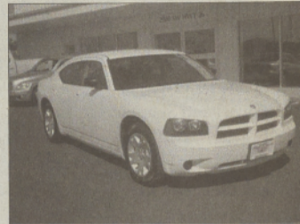
2007 Dodge Charger SE Sedan 4D Automatic, V6 2.7 Liter $21,780, NOW $17,840 Stock #P7080