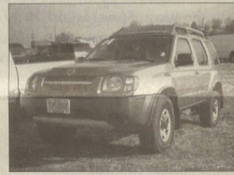
2004 Nissan Xterra XE Sport Utility 5-speed, V6 3.3 Liter NOW $13,840 Stock #P8053