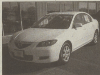
2008 Mazda3 Sport Sedan 4D Automatic, 4-Cyl. 2.0 Liter $17,995, NOW $16,840 Stock #P8035