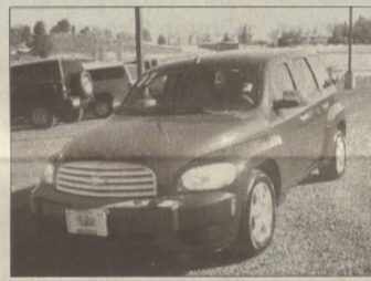
2007 Chevrolet HHR LT sport wagon Automatic, 4-cyl. 2.2 Liter $14,845, NOW $13,840 Stock #P8047