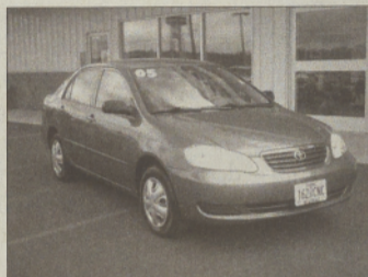
2005 Toyota Corolla CE Sedan 4D Automatic, 4-cyl. 1.8 Liter $19,665, NOW $11,840 Stock #0689A