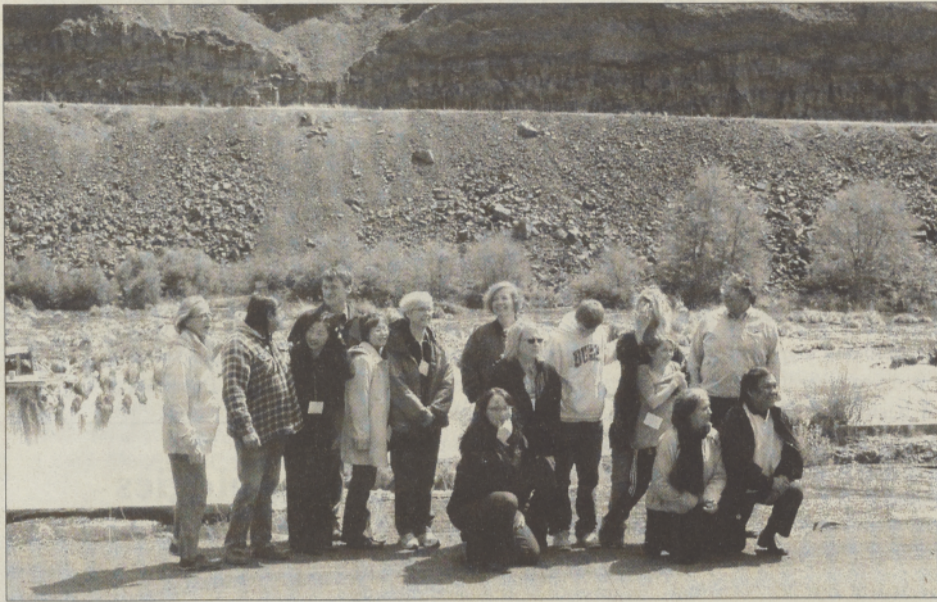
Representatives from various grant programs spent time touring Warm Springs as well as Sherar's Bridge and other areas, where they had the opportunity to learn about petroglyphs.

"They're all wanting to use their resources in the best and most effective way,"