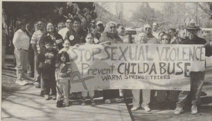
Community members marched last week to raise awareness.

Community members recently gathered together for several events in honor of Child Abuse Prevention and Sexual Assault Awareness Month.