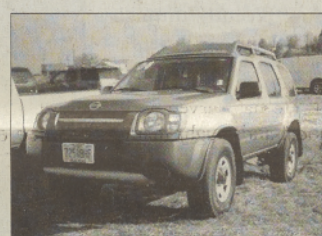
2004 Nissan Xterra XE Sport Utility 5-speed, V6 3.3 Liter NOW $13,840 Stock #P8053