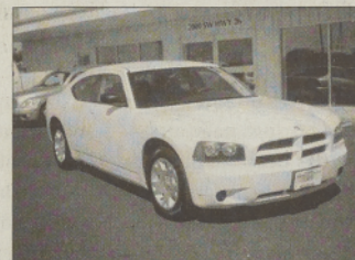
2007 Dodge Charger SE Sedan 4D Automatic, V6 2.7 Liter $21,780 NOW $17,840 Stock #P7080