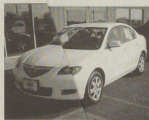
2008 Mazda3 Sport Sedan 4D Automatic, 4-Cyl. 2.0 Liter $17,995 NOW $16,400 Stock #P8035