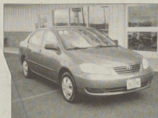
2005 Toyota Corolla CE Sedan 4D Automatic, 4-cyl. 1.8 Liter $13,566 NOW $11,840 Stock #489A