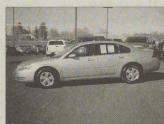
2007 Chevrolet Impala LT Sedan 4D Automatic, V6 3.5 Liter $16,895 NOW $14,840 Stock #P8044