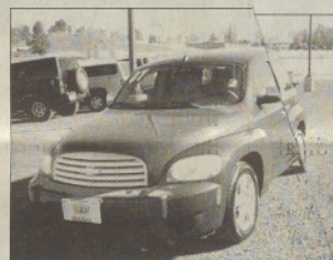
2007 Chevrolet HHR LT sport wago. Automatic, 4-cyl. 2.2 Liter $14,845 NOW $13,840 Stock #P8047