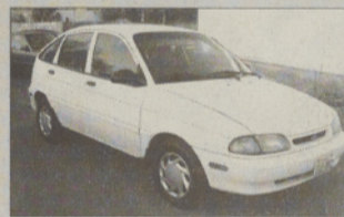
1996 Ford Aspire 5-speed, over 40mpg Book $2,410 This week $1,995