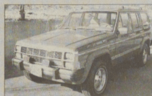
1987 Jeep Wagoneer Red Was $2,500 This week $1,750