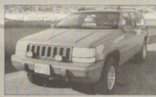
1995 Jeep Grand Cherokee Limited 4x4 Red, leather, auto was $6,995 This week $5,995