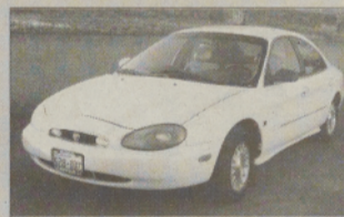
Mercury Sable White, Leather, auto Was $4,995 This week $3,995

Largest selection of pre-owned vehicles in Madras.