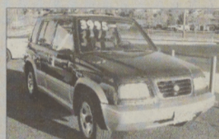
1996 Suzuki Sidekick 4x4 Book $5,495 This week $3,995