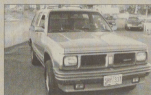
1992 Olds Bravada Leather Book $3,800 This week $2,495