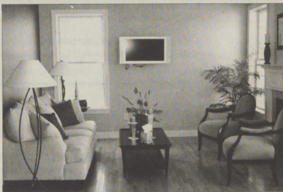
A full Service Design Center for all of your home or office needs

Above & BEYOND home furnishing & design center