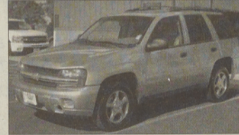
2007 Chevrolet Trailblazer Sport Utility 4D

6-Cyl, 4.2 Liter, auto, 4WD, $27,755 NOW $22,495 vin#115771