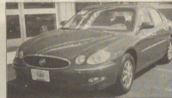
2006 Buick LaCrosse CXL Sedan 4D

V6, 3.8 Liter, auto, FWD, $47,745 NOW $14,995 vin#177564