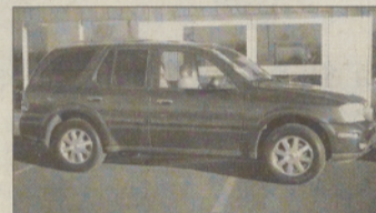
2006 Buick Rainier CXL Sport Utility 4D

6-Cyl, 4.2 Liter, auto, AWD, $24,995 NOW $21,495 vin# 322777