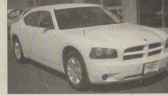
2007 Dodge Charger SE Sedan 4D

V6, 2.7 Liter, auto, RWD, $24,780 NOW $17,842 vin#695714