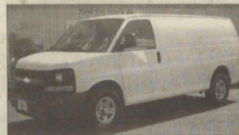
2007 Chevrolet Express Van 1500 Cargo

V6, 4.3 Liter, auto, RWD, $24,995 NOW $17,995 vin#102756