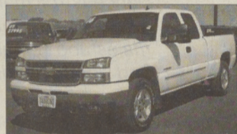
2006 Chevrolet Silverado 1500 Pickup Ext-Cab

V8, 6.0 Liter, HO, auto, 4WD, $28,995 NOW $24,495 vin#220030