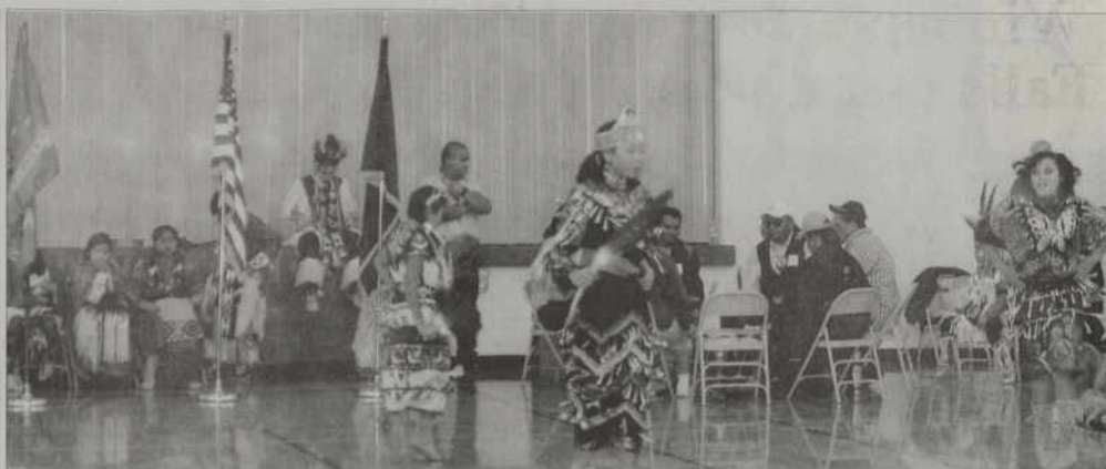
Jefferson County Middle School hosted the annual Native American assembly recently. Students of all ages demonstrated traditional dances for those at JCMS.