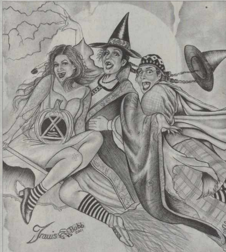
Tribal-theme Halloween drawing by Travis Bobb.