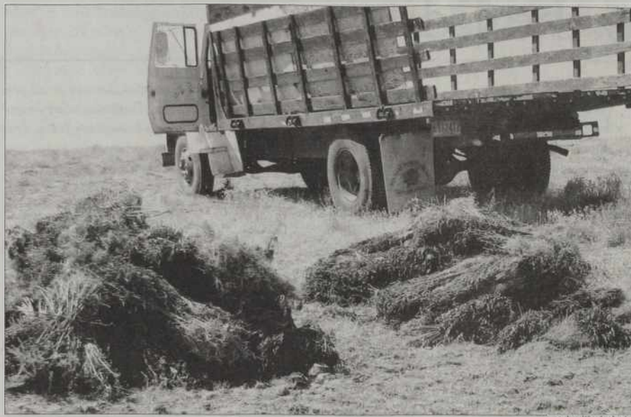
Marijuana found in the Mutton Mountain area of the reservation.

Drug Enforcement Administration officers were assisted by the Wasco County Sheriff's Office,