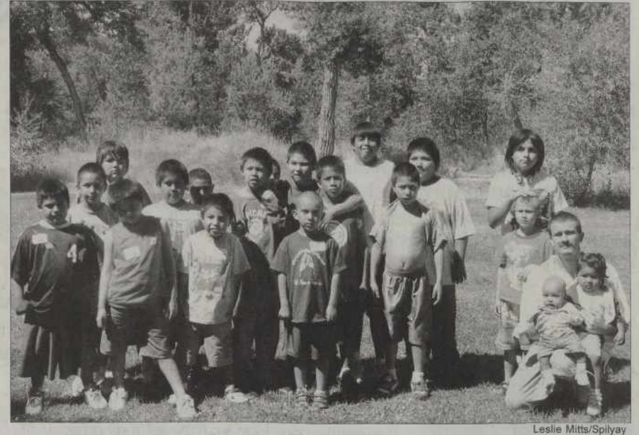
Boys at the camp created a rawhide Indian suitcase

learn something truly, truly traditional and cultural," Herkshan explained.