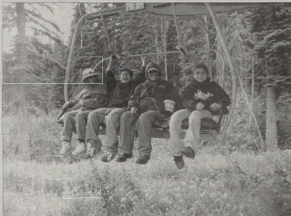
Huckleberry pickers use the Mt. Hood Meadows ski lift to gain access to the higher altitude berry bushes.