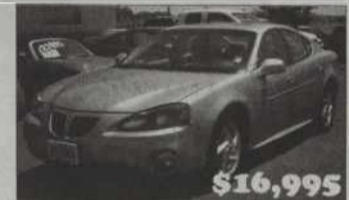
2004 Pontiac Grand Prix GTP Sedan 4D