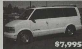
2000 Chevrolet Astro Minivan 3D