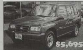
1997 Geo Tracker LSi Sport Utility 4D