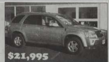
2006 Chevrolet Equinox Sport Utility