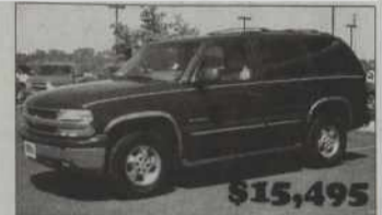
2000 Chevrolet Tahoe Sport Utility 4D