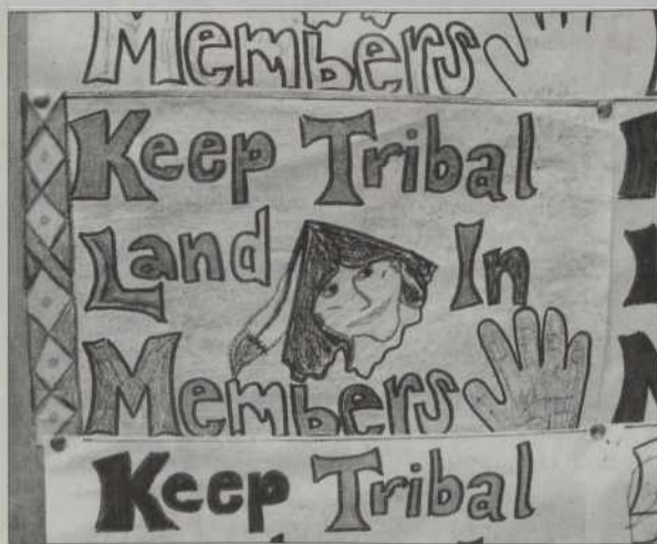
Above, youth artwork from a coloring contest that Armstrong conducted during Pi-Ume-Sha.

Individuals who schedule appointments with