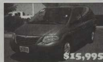
2005 Chrysler Town & Country LX Minivan