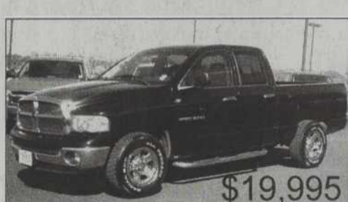
2004 Dodge 1500 Pickup Quad Cab Short Bed