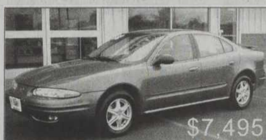
2002 Oldsmobile Alero GL Sedan 4D