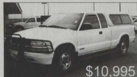
1999 Chevrolet S10 Pickup Extended Cab