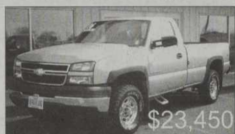
2006 Chevrolet Silverado 2500 Pickup HD Long Bed