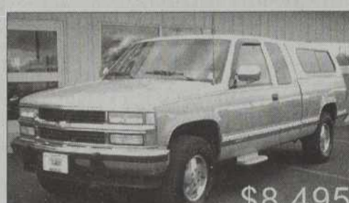
1994 Chevrolet 1500 Pickup Extended Cab Short Bed