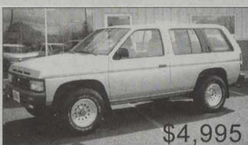
1990 Nissan Pathfinder XE Sport Utility 4D