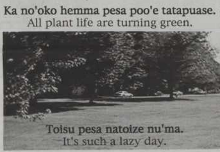
Toisu pesa natoize nu'ma. It's such a lazy day.