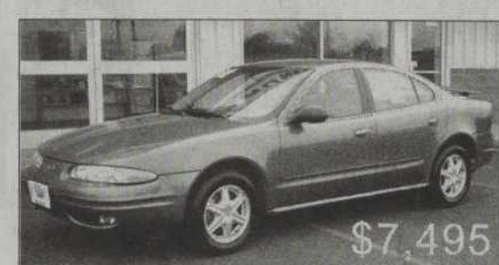
V6 3.4 Liter Automatic, FWD

2005 Chevrolet Silverado 2500 Pickup HD Ext. Cab Short Bed