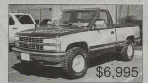
V6 4.3 Liter 5-Speed Manual, 4WD