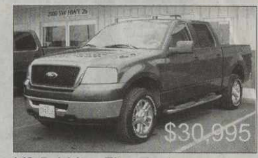
V8 5.4 Liter Flex Fuel Automatic, 4WD

2007 Chevrolet Suburban 1500 Sport Utility