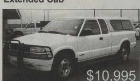
V6 4.3 Liter Automatic, 4WD