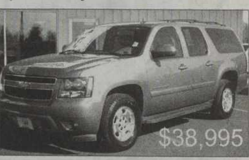
V8 5.3L Flex Fuel Automatic, 4WD

2007 Chevrolet Suburban 1500 Sport Utility