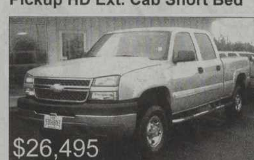
V8 6.0 Liter Automatic 4WD

2005 Chevrolet Silverado 2500 Pickup HD Ext. Cab Short Bed