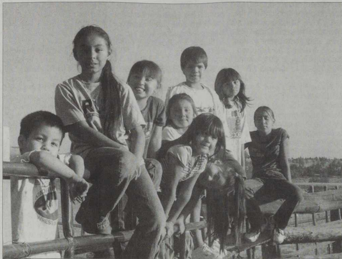
Young people gather for horse riding with Faith Trails.