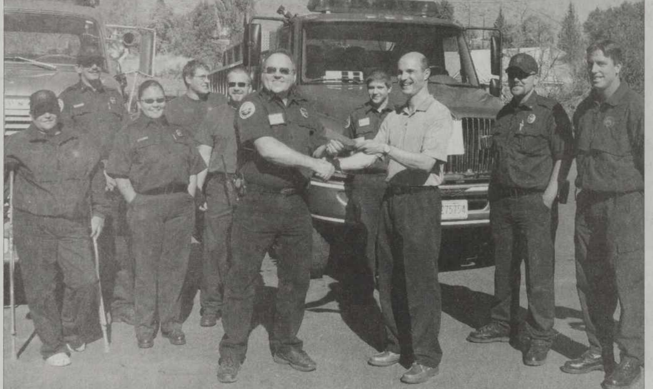
Warm Springs Fire and Safety receives grant to help in arson prevention.

tribes' account with the FM Global program and also at-