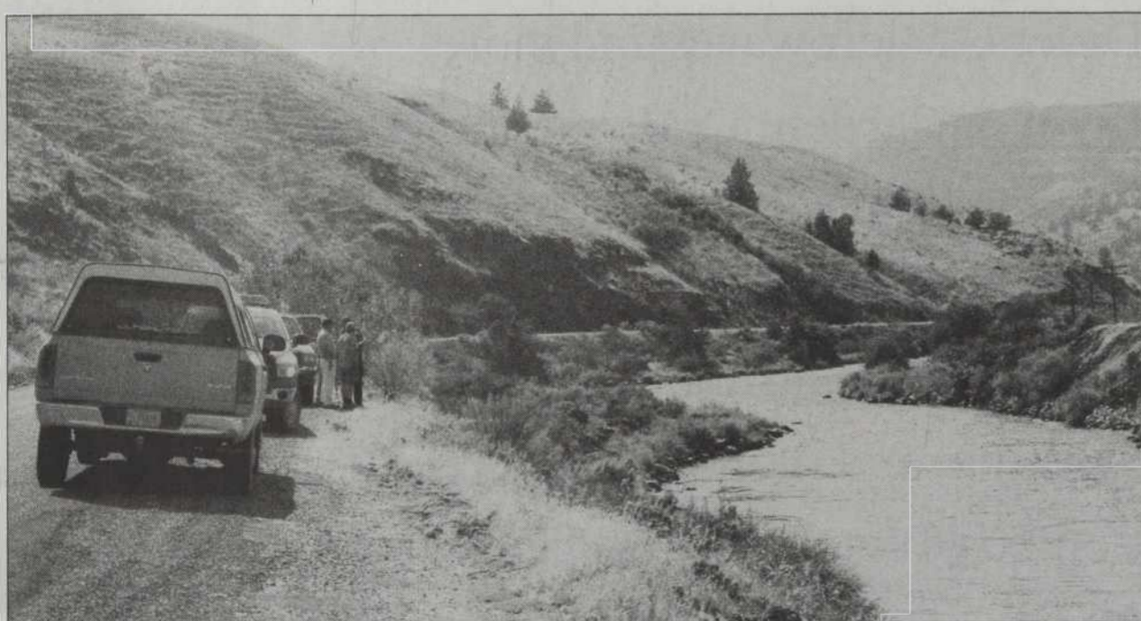
Search team at the Deschutes last week.

Sincerely, Soaring Butterflies and Warrior Spirit.