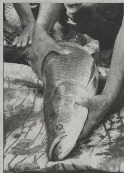
The Paiche fish.

Indigenous groups have even worked to develop hatcheries for the paiche in order to meet the demand for the fish. In Japan, Wewa said, the paiche is a delicacy.