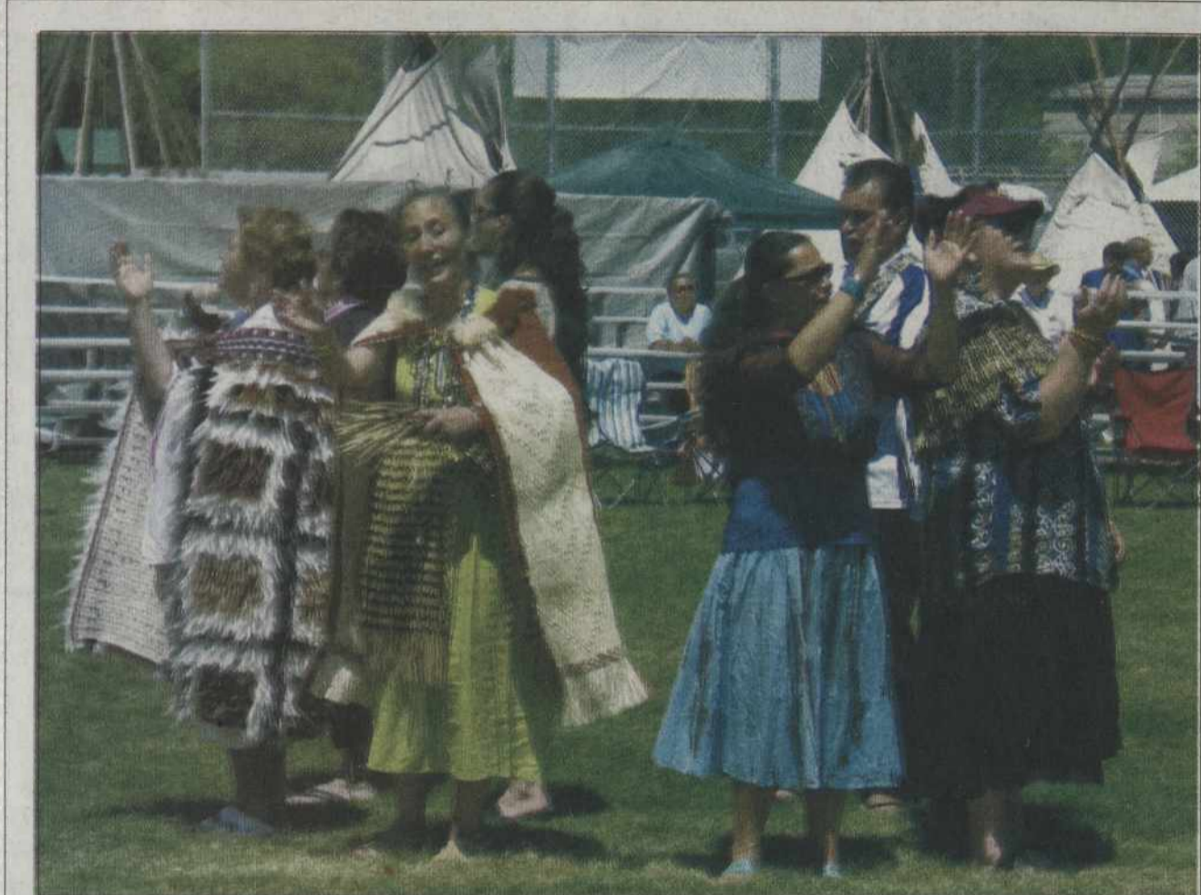
The Maori weavers perform a traditional dance at Pi-Ume-Sha.

General Admission .... $6.00 (12 & up) Under 12..... $3.00 (6 to 12) Five years & under .... Free Season Pass ..... $16.00 Includes: concert, rodeo, and dance.