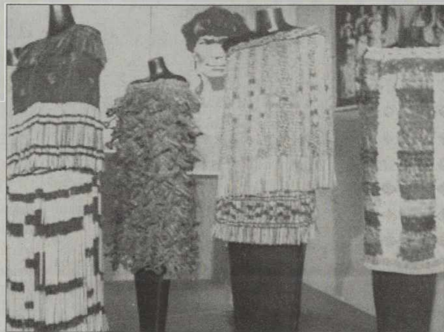
Traditional Maori garments are on display at the Museum at Warm Springs as part of the exhibit entitled "The Eternal Thread." Weavers demonstrated basket and garment weaving as well as traditional song and dance for several days. The venue is one of only four attended in the U.S. by the Maori weaving group.