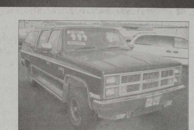
1984 Suburban 4x4 Diesel $995