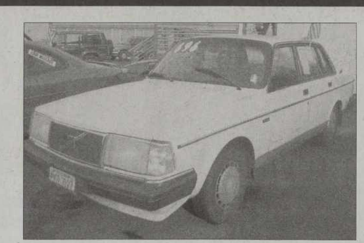
1986 Volvo 240 DL, Runs Good! $695